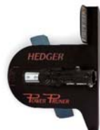
Hedger Accessory Part #99946400040