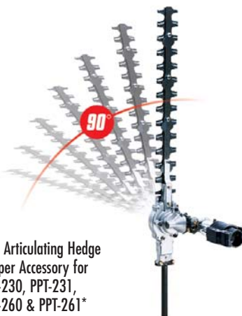
90° Articulating Hedge Clipper Accessory for PPT-230, PPT-231, PPT-260 & PPT-261*