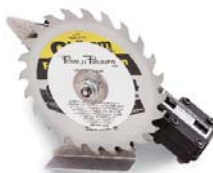
Circular Saw Accessory Part #99946400050